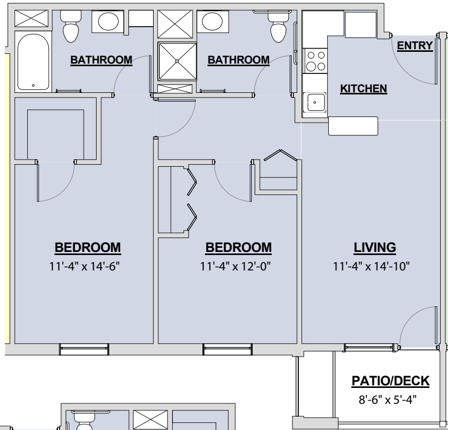
Magnolia (2 Bedroom w/ Balcony) 960 sq. ft.

ALL FLOOR PLANS MEET ACCESSIBLE REQUIREMENTS. ALL MEASUREMENTS ARE APPROXIMATE.